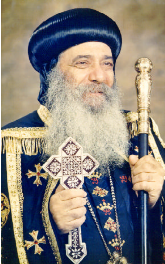
H.H. Pope Shenouda III, 117th Pope of Alexandria and the See of St. Mark