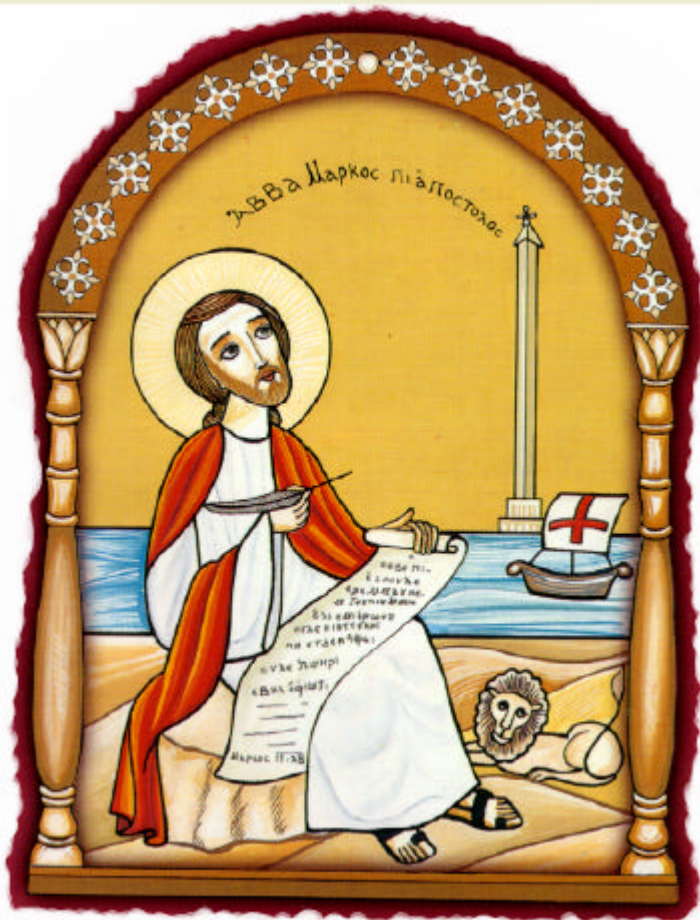
THE BEHOLDER OF GOD MARK THE EVANGELIST SAINT AND MARTYR