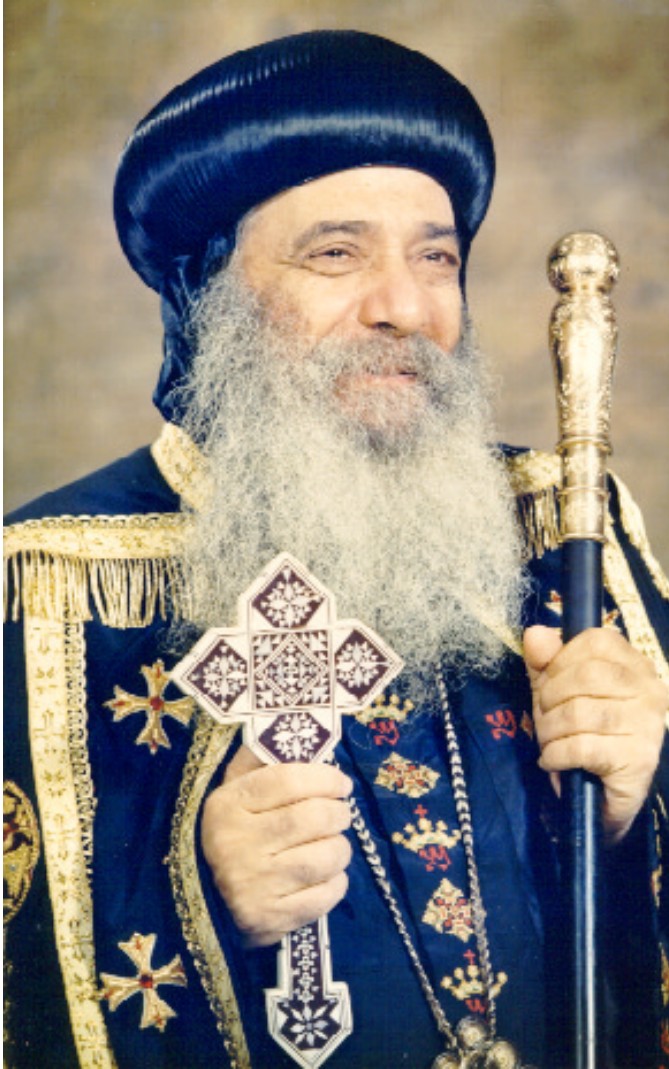
H.H. Pope Shenouda III, 117th Pope of Alexandria and the See of St. Mark